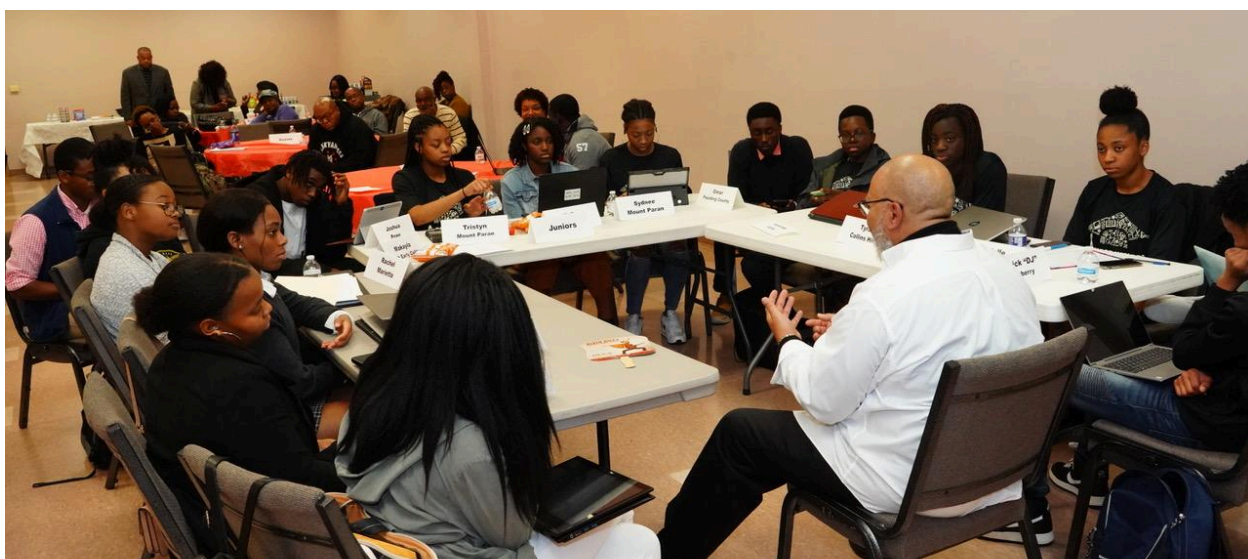
Engaging Students in Conversations About Career and College Choices